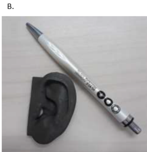
A. A stress-strain curves of PLLA films with different weight percentages of INT-WS 2 with error bars. The results for each specimen represent an average value of five samples. B. FDM printing with the WS 2 -NT-PLLA composite. An undyed model of a human ear printed from WS 2 -NT-reinforced PLLA ink (pen to scale). From: Lubricants 2019, 7(3), 28.